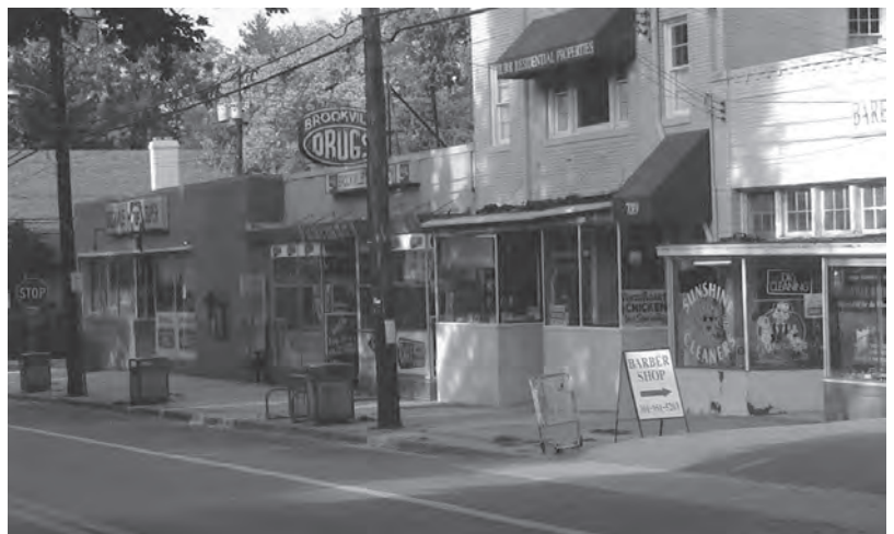
Same commercial area of Brookville Road today