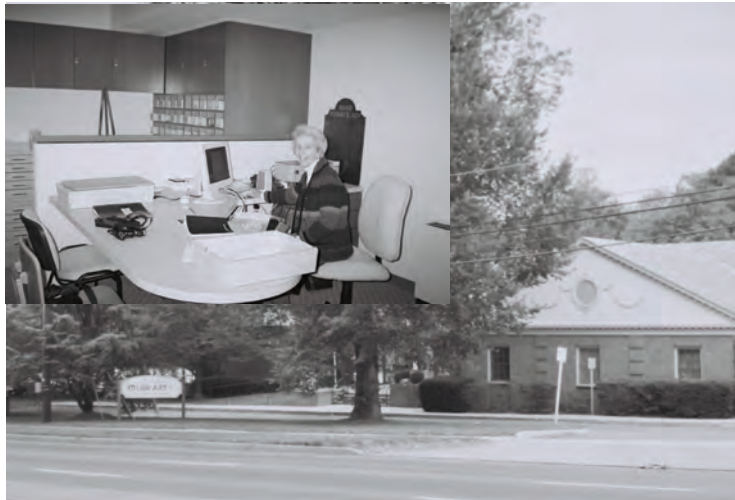
Chevy Chase Library at 8005 Connecticut Avenue, new location