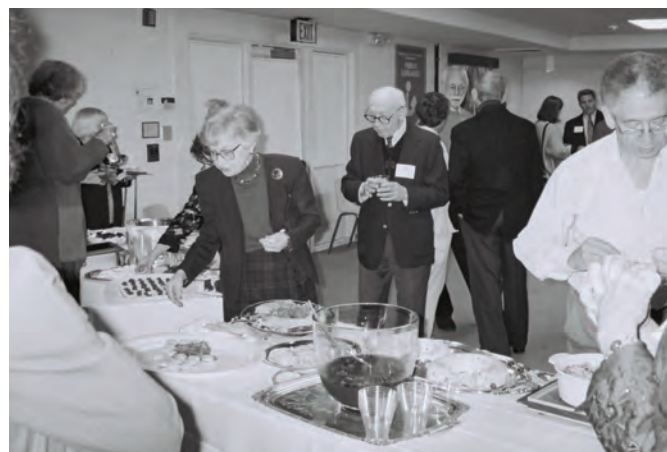
History buffs love to eat.