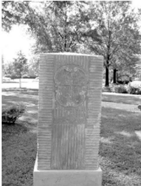
Restored Maryland marker

Some have asked why the beautiful display of the fountain in operation delighted residents and passers-by for a short time, then disappeared. Apparently, the timer for the Circle was not functioning due to power outages, and the fountain also was turned off before hurricane Isabel. It now is back on.