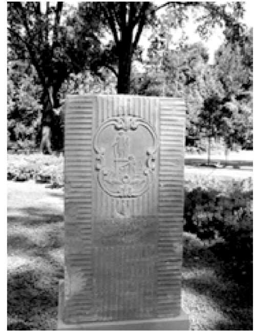
Restored District of Columbia Marker