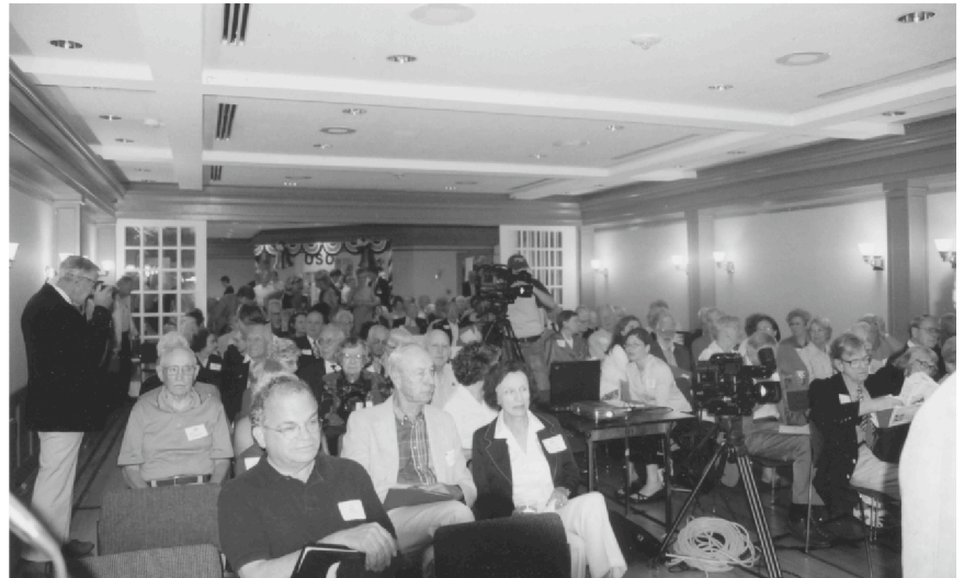
Part of the SRO audience at the Village Hall on May 26