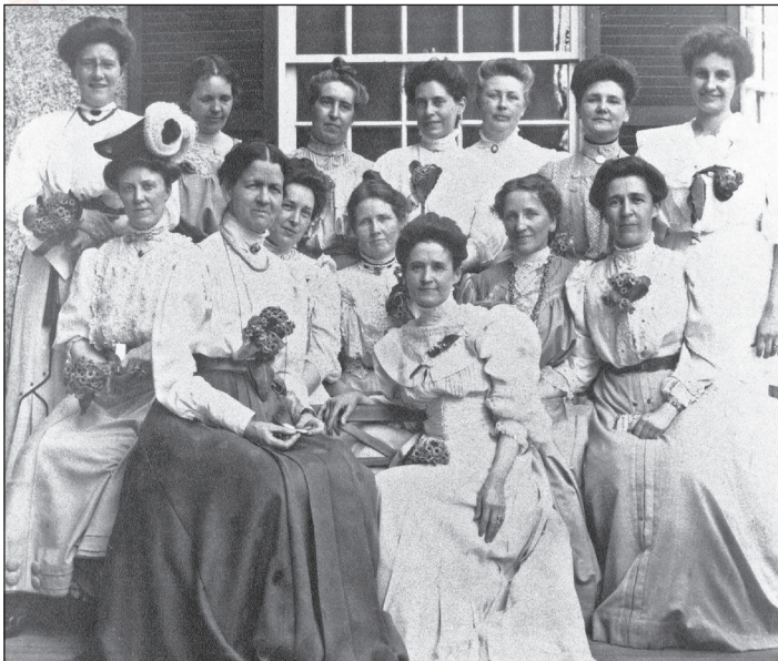
The Chevy Chase Reading Class, c.1905

Between 1896 and 1914, a remarkable group of early Chevy Chase residents created a “community of readers”, whose passion for reading led to the first community associations and institutions in the newly-established Chevy Chase. The story of these residents, and how three particular literary groups created a foundation for social and civic association in the new suburb, is told in CCHS’ newest online exhibit, Chevy Chase Reads . The launch of this exhibit, and the story behind it, will be celebrated at the CCHS 2017 spring lecture, “Readers Build Community: The Literary Culture of Early Chevy Chase.”