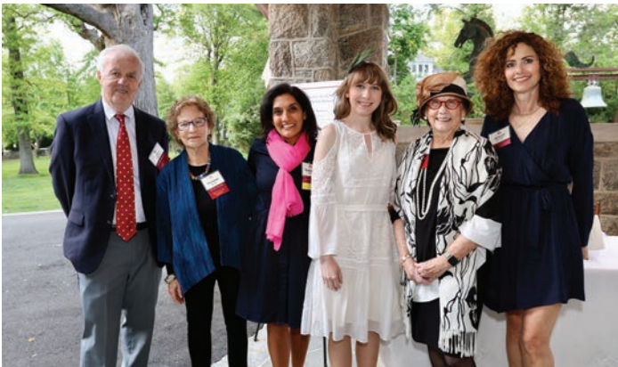
CCHS board members ready to welcome guests