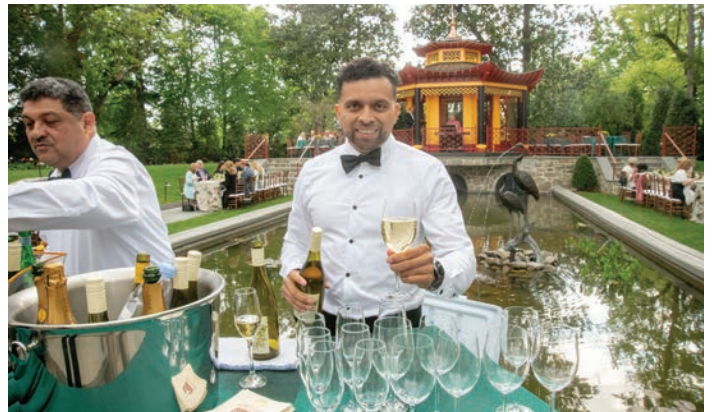
Do you prefer wine or champagne....