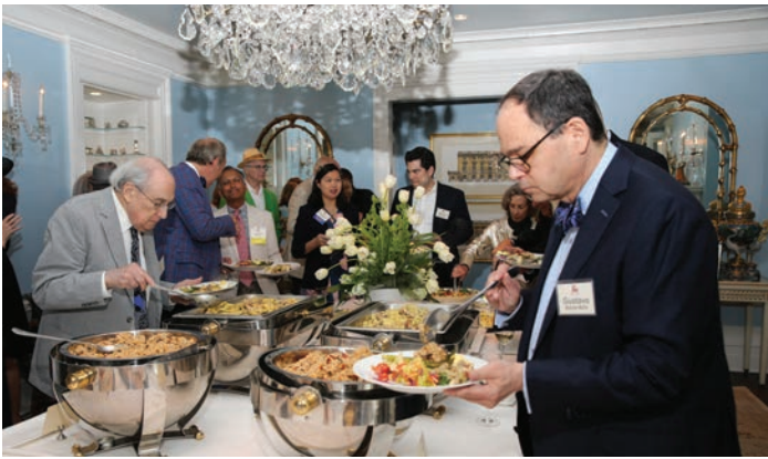
Guests enjoy La Ferme's lavish buffet dinner