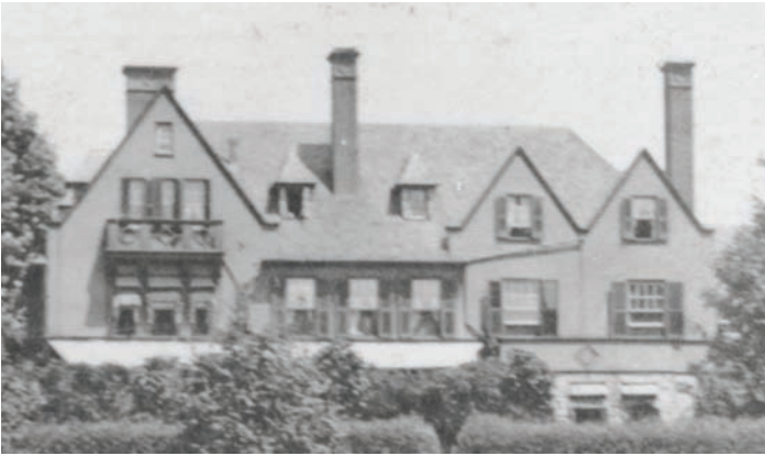
South facade of 9 Chevy Chase Circle in 1909