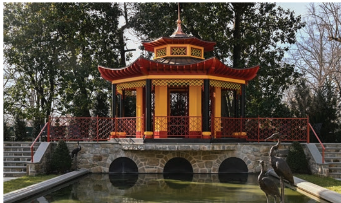
The Chinese Pavilion