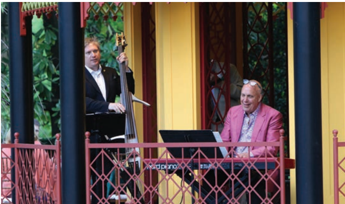
Music making in the Chinese Pavilion