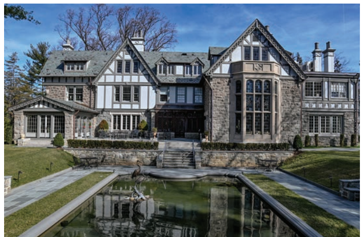
South facade of The Folly