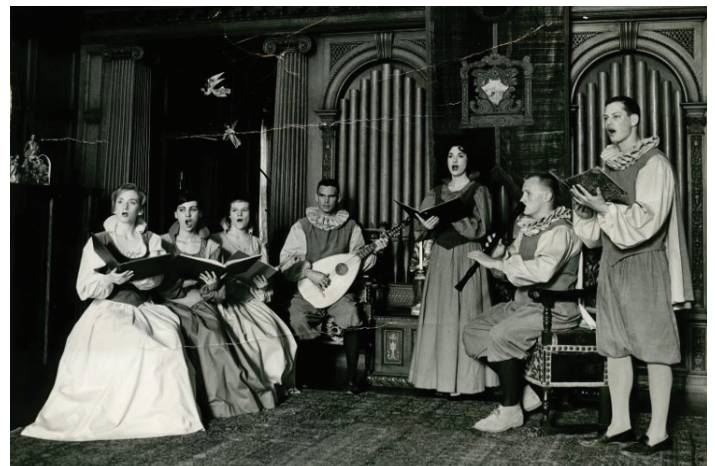
Madrigal choir in the music room, circa 1970