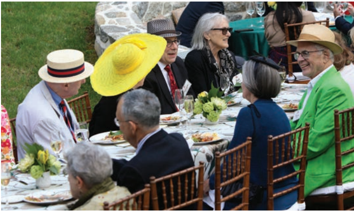
Five fetching hats around the table