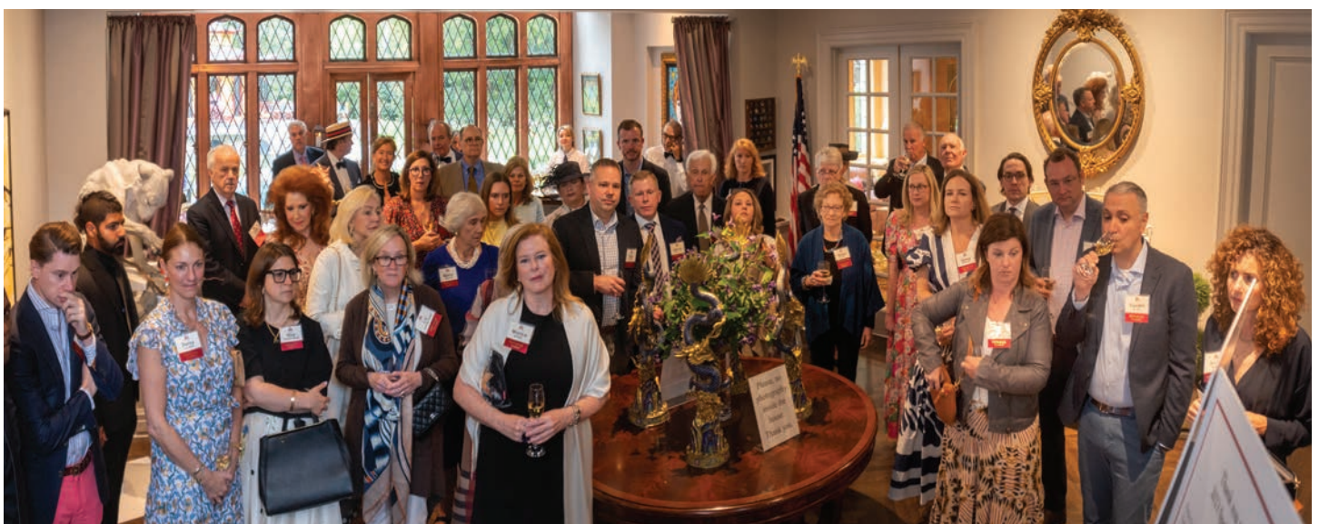
Pinnacle Sponsors assembled for a pre-Gala tour of The Folly

Thanks to Ms. Arsh's meticulous restoration, this iconic property stands again as the architectural centerpiece of the historic Chevy Chase community.