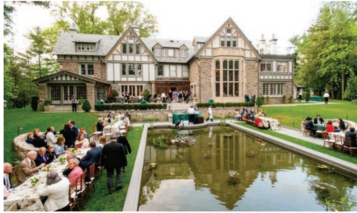
Gala guests enjoy dinner around the lily pond